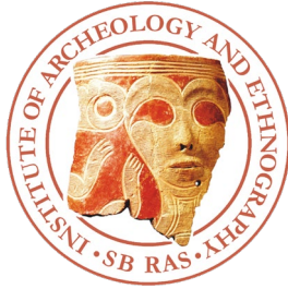
Institute of Archaeology and Ethnography of the Siberian Branch of the RAS